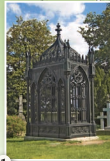
1 James Monroe