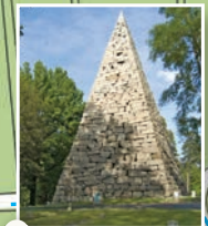
14 Confederate Soldiers Monument