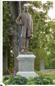
3 Jefferson Davis