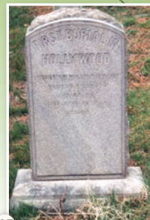
45 First Burial