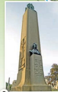
2 John Tyler