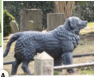
A Visitor's Favorite