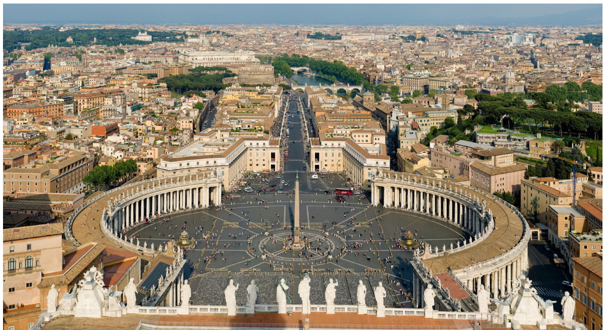
St. Peter's Square, Rome