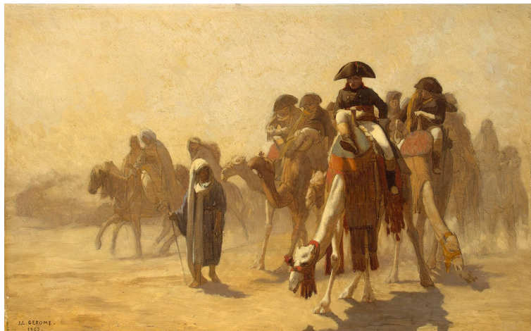
Napoleon in Egypt by Jean-Léon Gérôme