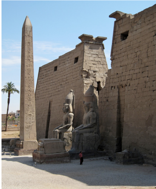
Ramses II obelisk at the Luxor Temple

In older parts of Hollywood, whether along the bluffs overlooking the rapids of the James or in sections farther from the river, the most arresting design among the varied monuments that strikes the eye is the obelisk, elegant in its simplicity, towering over the rolling hills. There are whole forests of them. How did that come to be? Most