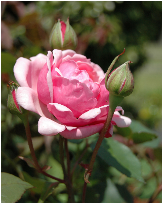
“Radiance” - the Goodall Rose (Section 20, Lot 45)

NONPROFIT ORG. U.S. POSTAGE PAID PERMIT NO. 671 23232