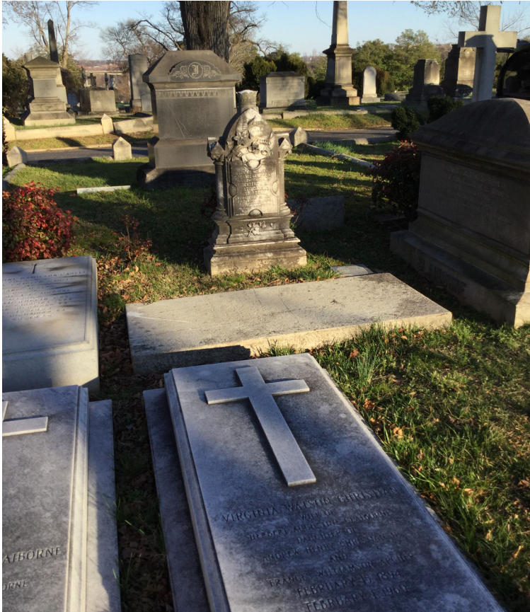
Claiborne Family Plot, Section 15, Lot 112. Hollywood Cemetery

When Hollywood Cemetery comes to mind, many recall that it is the final resting place for eighteen thousand Confederate dead from the battlefields and hospitals of the Civil War. And they would of course be correct. A little known fact is that in addition to these, many others from prior conflicts have found their way to Hollywood, re-interred there from earlier burial sites. For example, there have been numerous re-interments of individuals who bore arms in the War of 1812 and the American Revolution. And for each, there is a story.