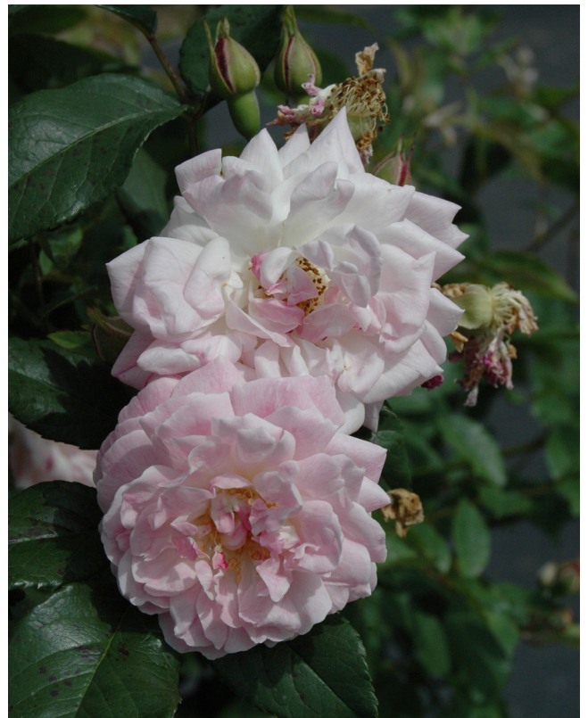
“Indica Major” - the Brandt Rose (Section 12, Lot 90)

Hollywood Cemetery is pleased to welcome the Heritage Rose Foundation on Saturday, May 20th. Devoted to the preservation of old roses, this group draws both U.S. and international visitors each year to the conference. For cost and other details, visit HeritageRoseFoundation.org .