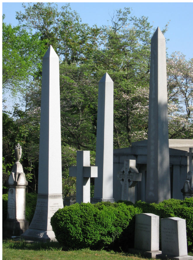
Obelisks in Hollywood Cemetery

In Hollywood the typical modern marker is a low granite stone no more than several feet in height. As a result, the towering granite sentinels of obelisks erected in earlier times still dominate the view. Even in the twenty-first century, if not as prolific as before, new obelisks have taken their place in the cemetery. The newest ones can be seen in a redeveloped lane in the Chapel Hill section, one of the oldest in Hollywood, and in the Idlewood section, one of the newest. Today the monoliths inspired by ancient obelisks first quarried by the pharaohs along the Nile still stand guard as they