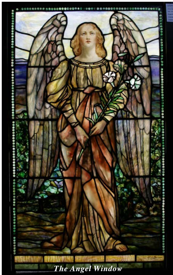
The Angel Window