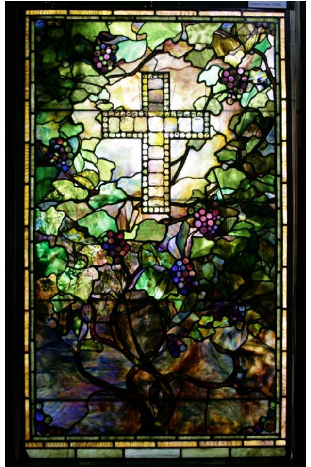
The Cross Window

extremely popular in the Gilded Age, late 1800s and early 1900s,” said Taylor. “Opalescent glass is a base of white with added colors. The white makes the glass more