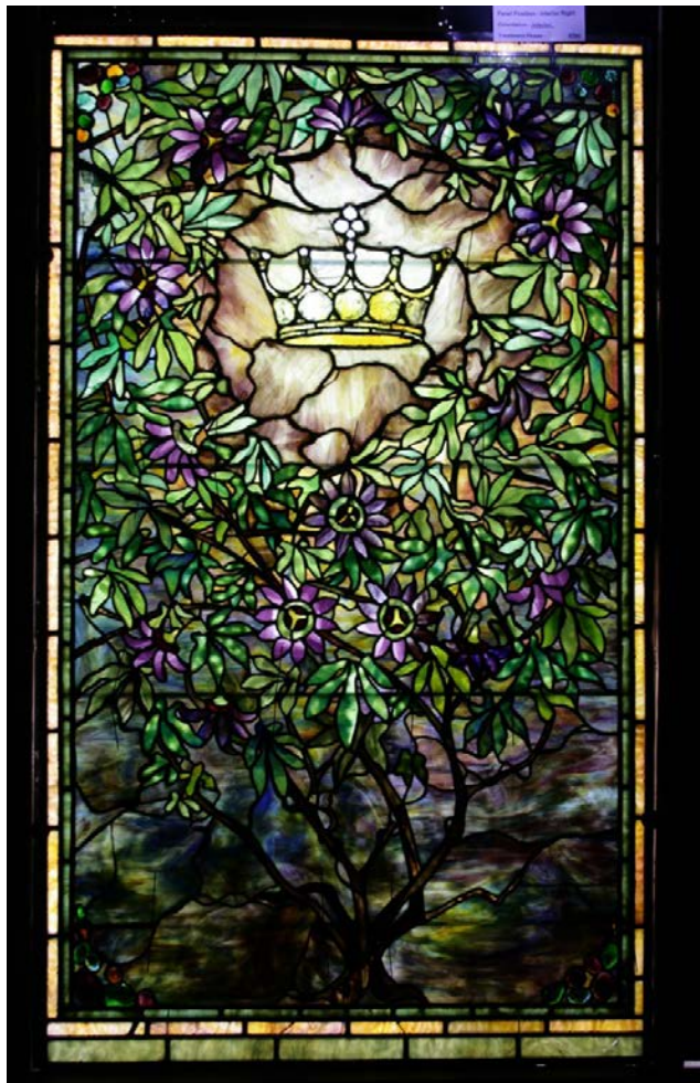
The Crown Window

Taylor and his staff then disassembled each window, taking extraordinary care to document and clean each