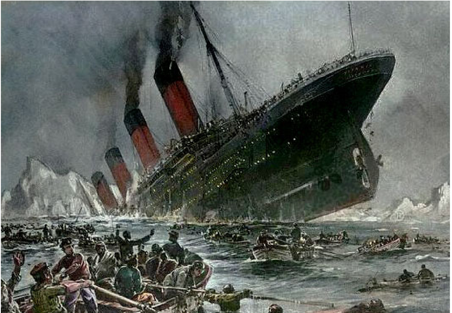
A fanciful rendering of the Titanic's last moments