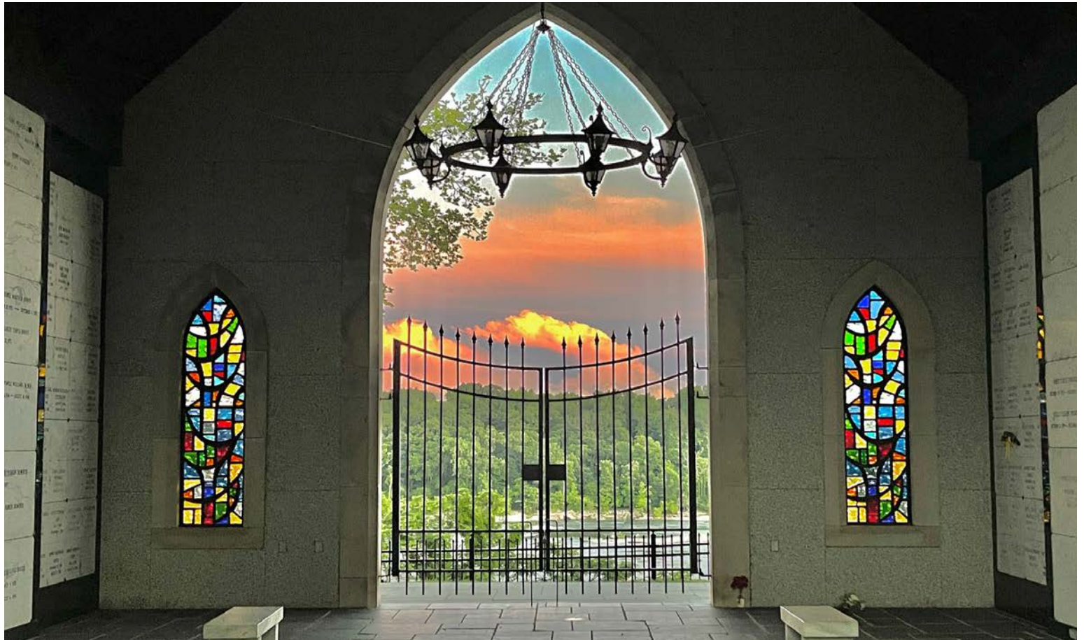
Sunset Reflection viewed from the Palmer Mausoleum