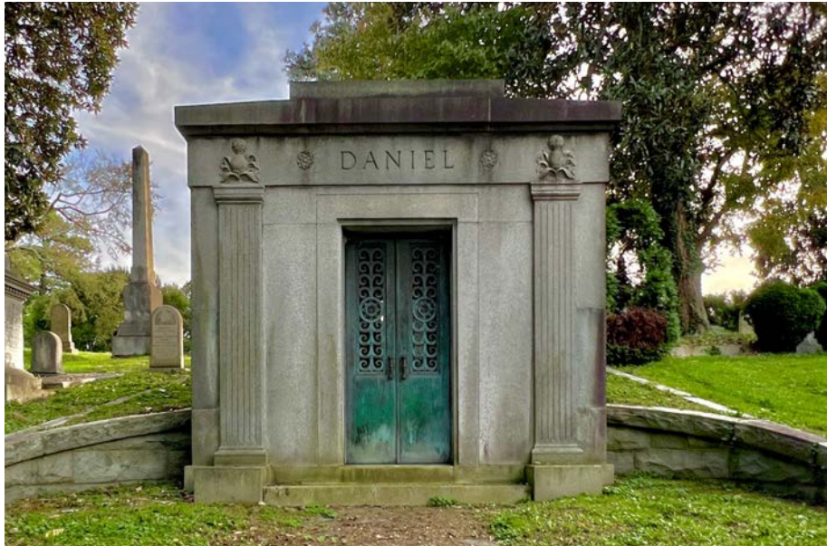
The Daniel family mausoleum