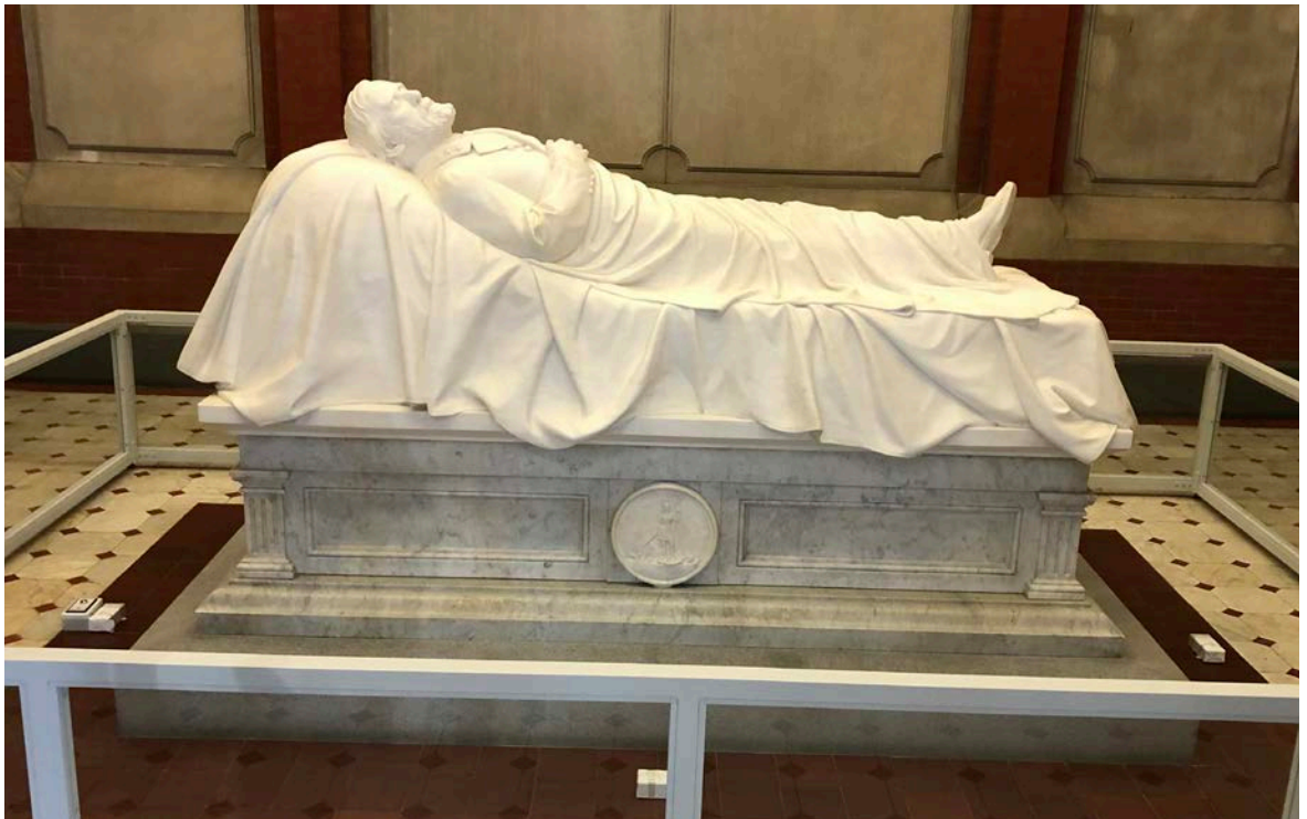
The Robert E. Lee sarcophagus at the Lee Chapel, Washington & Lee University, Lexington, Virginia

Contributed by The Valentine Richmond, Virginia